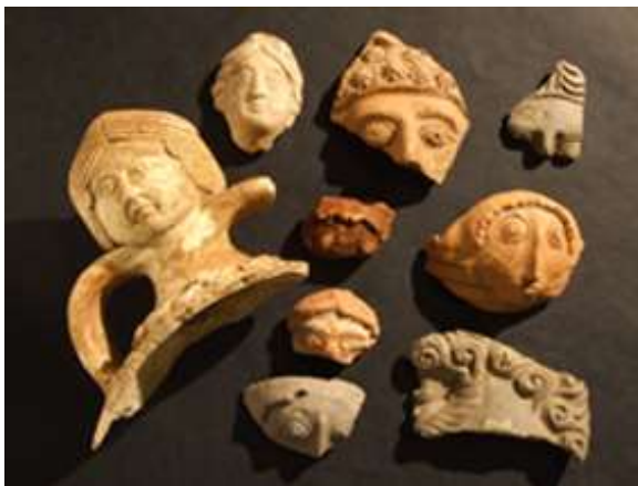
3D face mould from Vindolanda