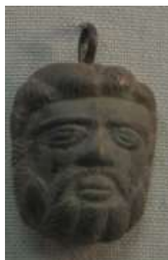
Beaten silver figure from Tullie House