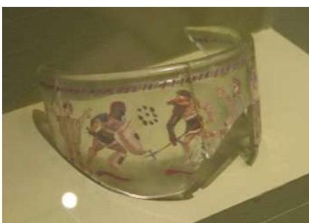
Painted Glass from Vindolanda