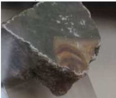
Painted plaster from English Heritage